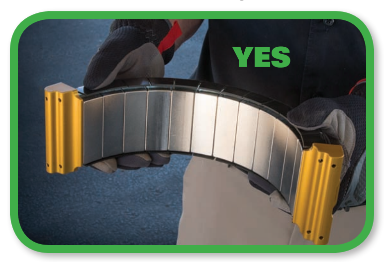
Correct way to hold the XT during installation.