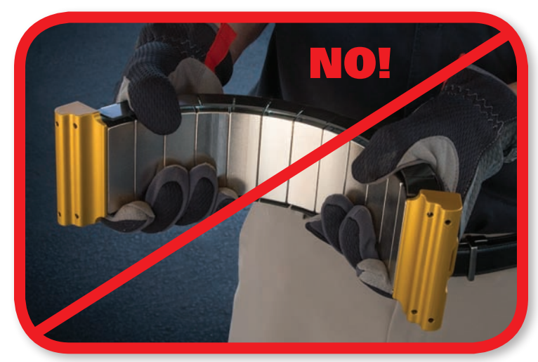
Don't let your fingers get between the magnets and the filter housing or serious injury could result.